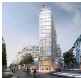
Springer Quartier Hamburg