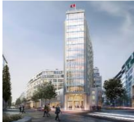
Springer Quartier Hamburg